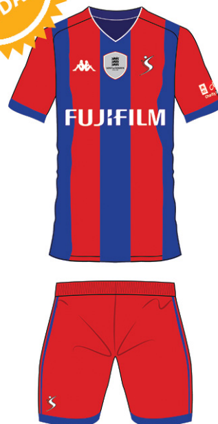
ASA 2017-2020 UNIFORM