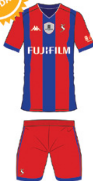
ASA 2017-2020 UNIFORM